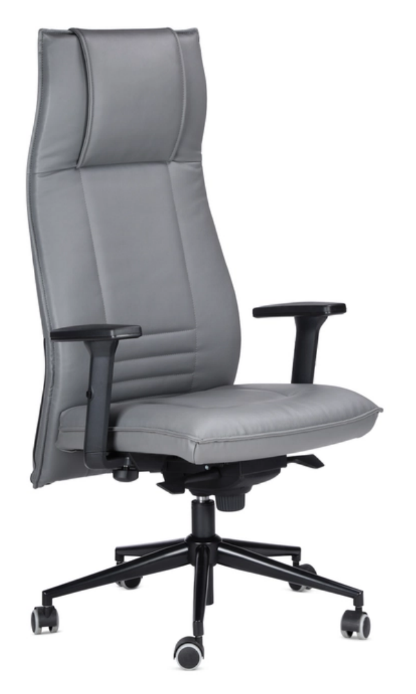
THE PHOTO MAY INCLUDE OPTIONAL